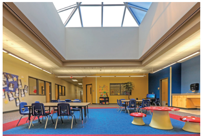
French Elementary School, Spring, TX