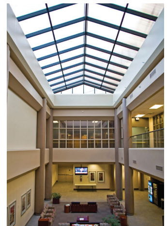
North Fulton Hospital, Roswell, GA