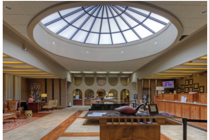
The Peoples Bank, Eatonton, GA