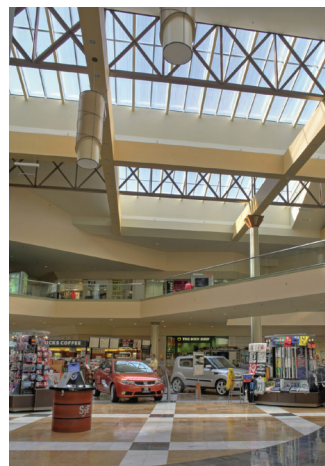
Rockaway Town Center, Rockaway, NJ